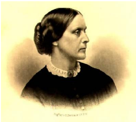
Susan B. Anthony

1848 - The first Women's Rights convention in Seneca Falls, New York was held. Equal suffrage proposed by Elizabeth Cady Stanton was adopted.