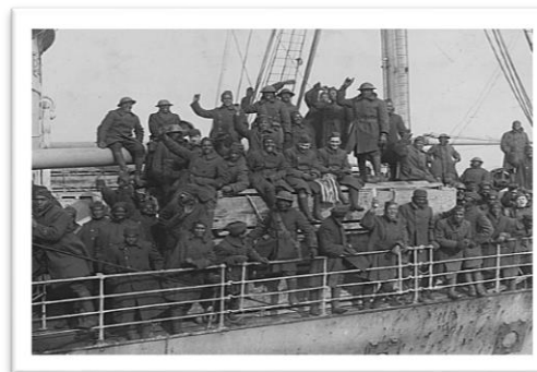
The Harlem Hellfighters Returning from World War I

Two members of the unit Corporal Henry Johnson and Private Needham Roberts were the first United States soldiers to receive the Croix de guerre award from France (the highest French award for bravery in World War I). By the end of the war 171 members of the unit as well as the unit as a whole had received the medal.