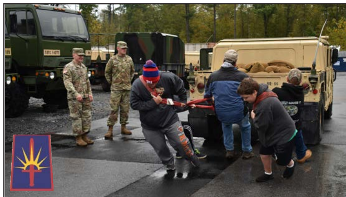
Boy Scouts attempt to pull a Humvee during their Guard Life experience at the Queensbury Armory, on Sept. 30, 2017.