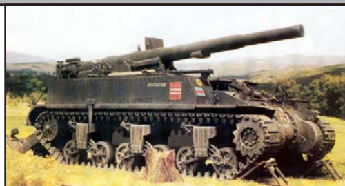
The 155mm self-propelled howitzer used by the 258th Field Artillery in World War II.