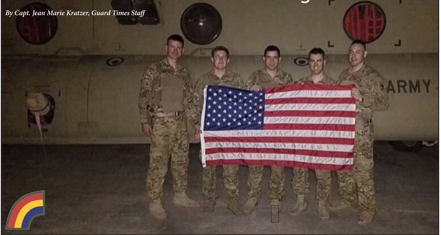
Soldiers of Company B, 3rd Battalion, 126th General Support Aviation Battalion show their colors during the unit's deployment in Afghanistan from January to October of 2017. Twenty members of the Rochester based unit flew more than 130 combat missions during their deployment, returning home November 8.