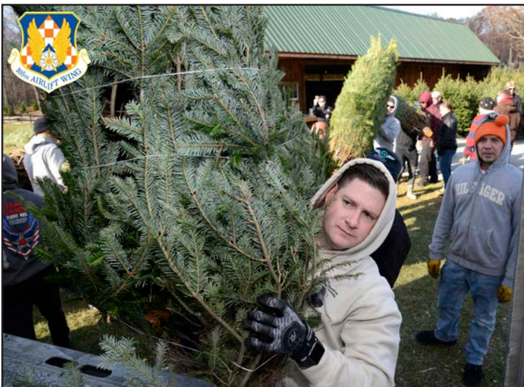
More than a dozen New York Air National Guard Airmen assigned to the 105th Airlift Wing in Newburgh also volunteered their time to load donated Christmas Trees on November 27 in Cornwall, N.Y., as part of the national Trees for Troops effort. The trees are destined for military installations and families across the country.