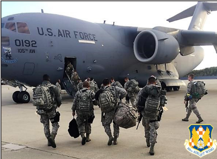
New York Air National Guard Airmen assigned to the 105th Airlift Wing's Base Defense Squadron board one of the wing's C-17s at Stewart Air National Guard Base in Newburgh, N.Y. Oct. 6, 2017 heading for the Island of St. Croix in the U.S. Virgin Islands. The Airmen conducted security duties on the island as part of the response to Hurricanes Irma and Maria.

While the 106th Rescue Wing deployed boots on the ground, the 105th Airlift Wing based in Newburgh, N.Y., provided C-17 airlift for domestic operations missions, while the 109th Airlift Wing at Scotia, N.Y. provided additional C-130 airlift support, moving personnel and equipment.