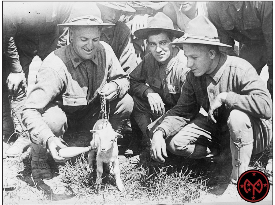
New York National Guard Soldiers of the 27th Infantry Division training at Camp Wadsworth, South Carolina, feed their company mascot sometime in 1917. The 27,000 Soldiers of the division trained at Camp Wadsworth, just outside Spartanburg, from September 1917 to April 1918 before deployment to France for service in WWI.

These British physical fitness trainers, O'Ryan noted, used a version of the game "Simon Says" to teach the raw American Soldiers to think on their feet and respond only to the right orders. Commands like "forward march"