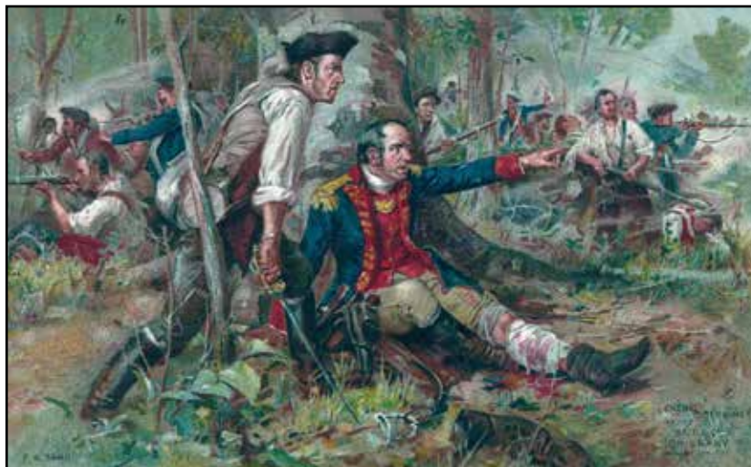
New York Militia Brig. Gen. Nicholas Herkimer is remembered in a 1977 commemorative postage stamp released for the bicentennial of the Battle of Oriskany, N.Y. in August 1777. The stamp was a painting by Frederick Yohn depicting Herkimer, mortally wounded and with his back against a tree, directing the fighting to rally his men to resist an ambush force of Tories, Indians and British troops while en route to the relief of Fort Stanwix, in nearby Rome, N.Y. The militia had started the battle with 800 troops, but only 150 walked away, taking with them about 50 wounded. Their effort led to the successful defense of Fort Stanwix and contributed to the American success at Saratoga the following month. The painting hangs in the public library in Utica, N.Y.

I am humbled beyond words to have this amazing opportunity to continue in the service of my nation, my state, my family, and brothers and sisters in arms — all of YOU, TEAM NEW YORK.