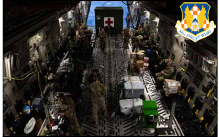
Airmen of the 10th Expeditionary Aeromedical Evacuation Squadron convert a 105th Airlift Wing C-17 Globemaster III to a flying hospital at Ramstein Air Base, Nov. 17, 2023.

"I remember we evacuated someone who fell and hit their head," Kopacz recalled. "They were in critical condition, but we were able to fly them to the care they needed. It feels really good when we drop off patients and know we may have saved their lives." 🇺🇸