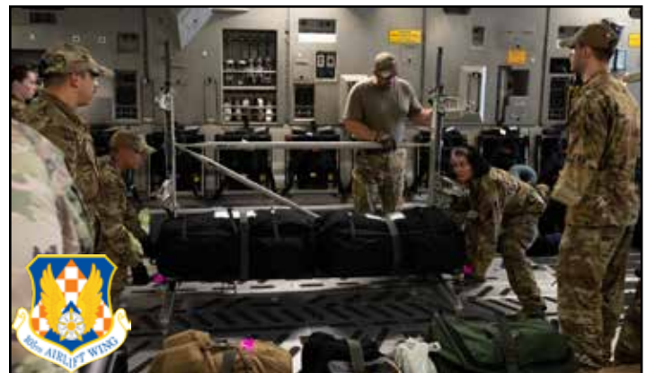
Airmen of the 10th Expeditionary Aeromedical Evacuation Squadron convert a 105th Airlift Wing C-17 Globemaster III to a flying hospital at Ramstein Air Base, Nov. 17, 2023.

"We're proud to support a federal mission like this that really makes a difference in people's lives. "It is one of the most rewarding missions out there,"