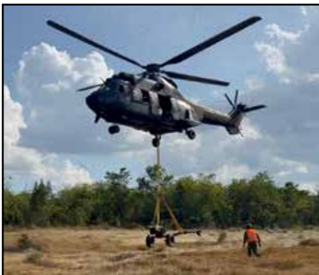
A Brazilian Army HM-4 Jaguar helicopter sling loads a howitzer into position during Southern Vanguard 24 in Ferreira Gomes, Brazil, on Nov. 12, 2023.

the change to cross-trained on the 7th Special Forces Group's water purification equipment.