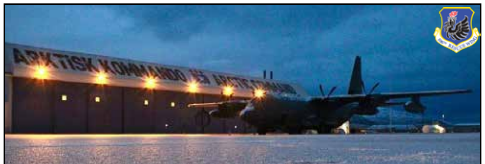
An HC-130 Combat King II rescue aircraft assigned to the 106th Rescue Wing, readies for missions supporting Exercise Arctic Light 2023 in Greenland, Sept. 25, 2023. The bilateral training with Denmark’s Joint Arctic Command advanced the capabilities necessary to operate in the Arctic while also strengthening relationships.

“The Danish were very happy with what we delivered for them in terms of capability and accuracy with our drops,” Rhoads said “We’re working toward having them come to us for training as well as going back for the next Arctic Light exercise.” gt