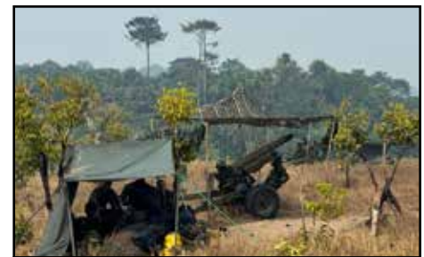
New York Army National Guard and Brazilian field artillery soldiers employ a Brazilian Army 105mm towed howitzer in Ferreira Gomes, Brazil, in Ferreira Gomes, Brazil, on Nov. 12, 2023.