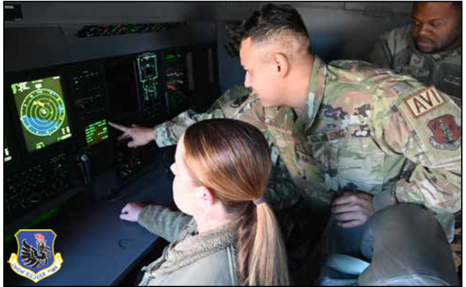
An Airman from the 106th Rescue Wing Maintenance Group points to a computer screen while training members of the Georgia Air National Guard's 165th Airlift Wing Maintenance Group on the HC-130J Combat King II search and rescue aircraft at F.S. Gabreski Air National Guard Base on Long Island, Nov. 14, 2023. Airmen from the 165th Airlift Wing Maintenance Group traveled to the 106th to be trained on the C-130J aircraft in preparation for their own aircraft conversion.

The 165th Airlift Wing started the aircraft