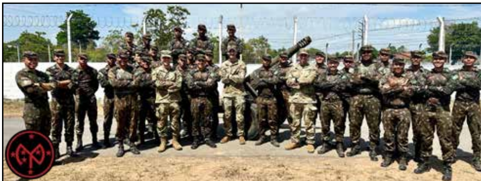
New York Army National Guard and Brazilian field artillery soldiers pose for photo in Ferreira Gomes, Brazil, on Nov. 12, 2023. The two artillery elements trained together during exercise Southern Vanguard 24.