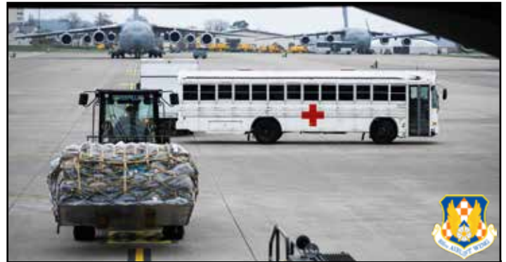
Airmen assigned to the 105th Airlift Wing and 10th Expeditionary Aeromedical Evacuation Flight prepare to load patients and bags onto a C-17 Globemaster III for airlift out of the US Central Command area of operation, Nov. 18, 2023. The 105th Airlift Wing spent four months flying out of Ramstein Air Base, Germany for the missions.