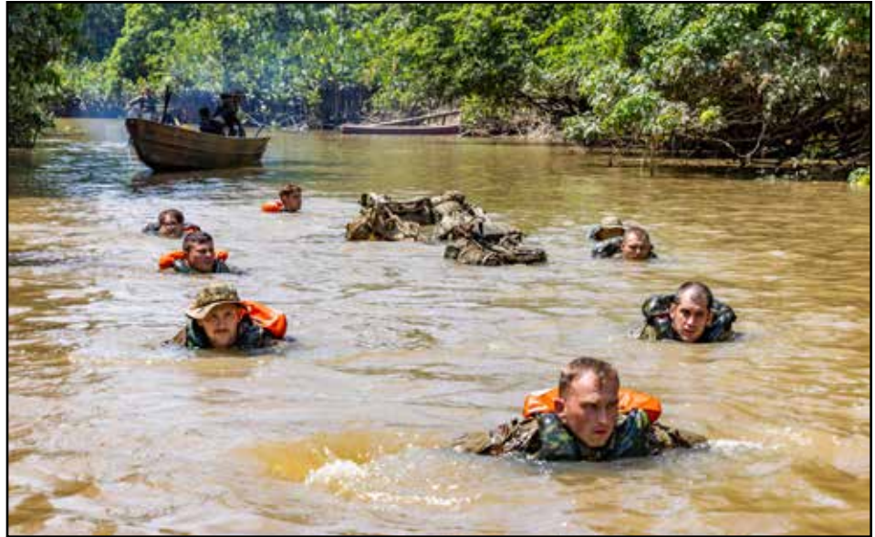
U.S. Army Soldiers conduct jungle movement during Southern Vanguard 24 in Belem, Brazil, Nov. 3, 2023. New York Army National Guard Soldiers joined elements of the 101st Airborne Division during the field training exercise in the Amazon Jungle. Southern Vanguard is designed to enhance interoperability between partner forces.

New York has worked alongside Brazil through the National Guard’s State Partnership Program since 2019, executing bilateral military