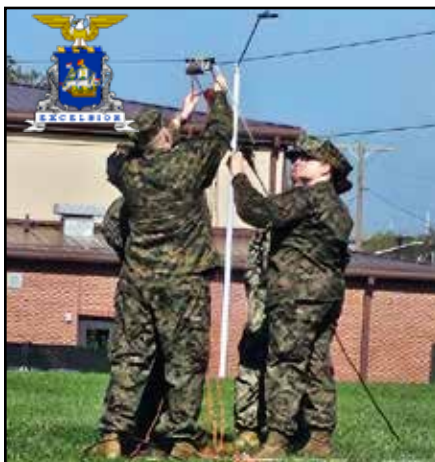
New York Naval Militia members setup a communications antenna at Fort Hamilton, N.Y., to support Empire Challenge Oct. 3, 2023.

"The experience we gained in this exercise will be very important and useful for us in future operations," he said. gt