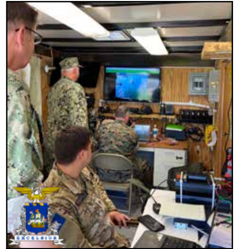
New York Naval Militia Rear Admiral Larry Weill, foreground at left, monitors live video from a drone over Great South Bay off the south shore of Long Island, Oct. 3, 2023. The drone operated from a Naval Militia patrol boat 30 miles away from the command post at Fort Hamilton.

As communications continued on Wednesday, October 4, the Civil Air Patrol flew an airborne repeater aboard a C172 aircraft over New York City. Ground-based radio stations then bounced their signals off the repeater to Syracuse. The airborne repeater worked perfectly and high-frequency com-