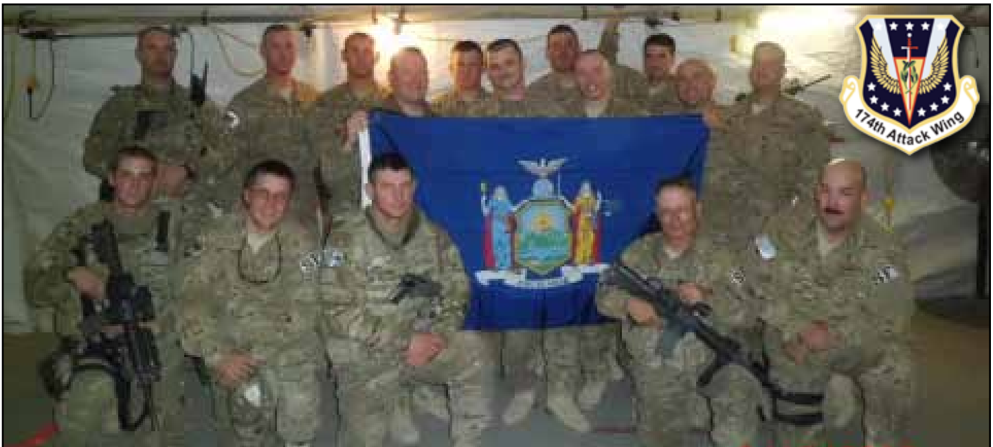
Members of the 174th Attack Wing Security Forces Squadron pose for a group photo while deployed to Bagram Air Base, Afghanistan in late 2012. A total of 30 personnel deployed from Hancock Field Air National Guard Base and provided an array of security functions both inside and outside the wire. This was the fourth overseas deployment for the SFS since 2005.