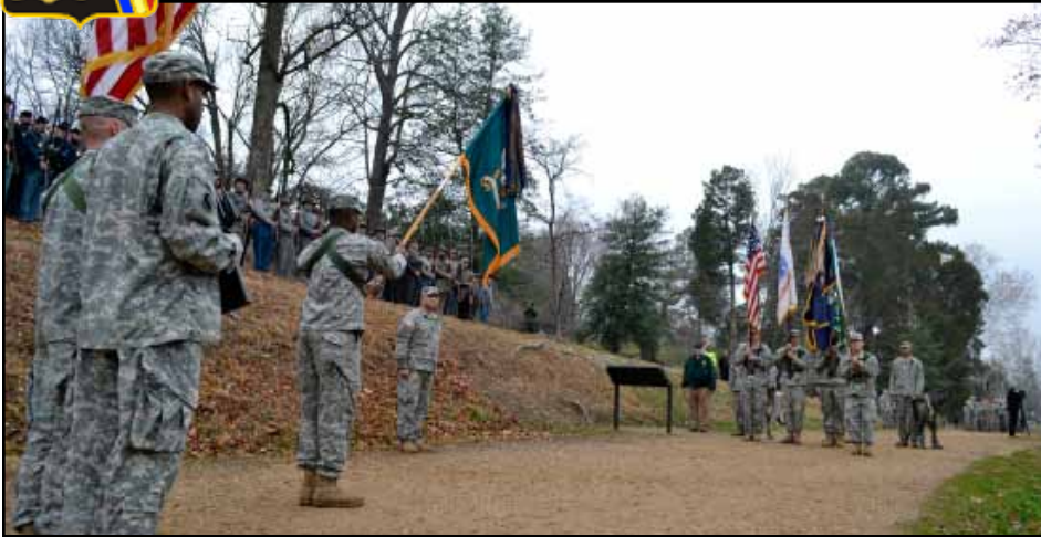
Soldiers from the Sandston-based Battery A, 1st Battalion, 111th Field Artillery Regiment, 116th Brigade Combat Team and the Fredericksburg-based 116th Brigade Special Troops Battalion, 116th Brigade Combat Team participate in the sesquicentennial celebration of the Battle of Fredericksburg Dec. 9. Elements of the New York-based Company A, 1st Battalion, 69th Infantry and the 116th BCT greeted each other on the Sunken Road where they met 150 years ago – then as enemies, today as friends.