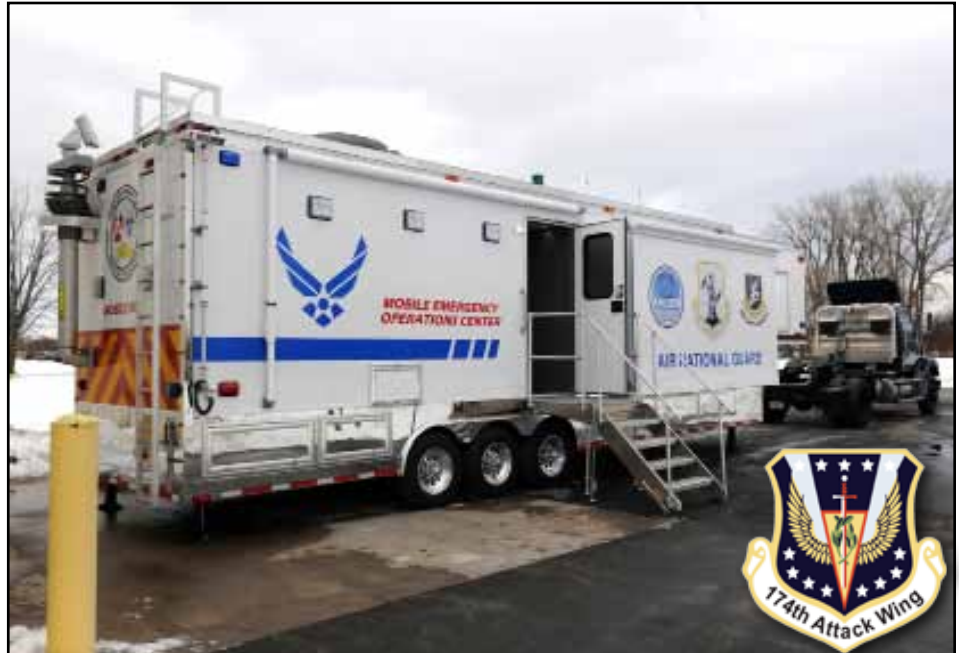
New York State Mobile Emergency Operations Center (MEOC) assigned to the 174th Civil Engineering Squadron. The operations center can be deployed in support of the Federal Emergency Management Agency to assist first responders during disaster response efforts.

The MEOC has up to eight workstations and a conference room. The center has its own weather and Direct TV satellites, providing up to date weather or news information. gt