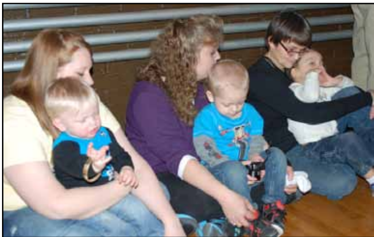
Families of Soldiers assigned to the 222nd Military Police Company await the start of the units deployment ceremony held Feb. 22, at the historic Hornell Armory.

The unit is conducting post-mobilization training at Camp Shelby, MS prior to deploying. gt