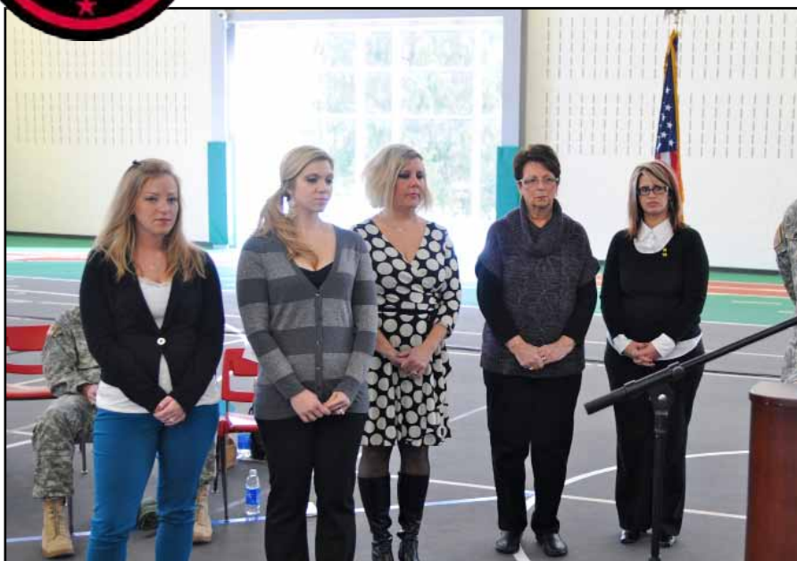
Headquarters and Headquarters Company, 2nd Battalion, 108th Infantry Regiment's Family Readiness Group is recognized during the units Freedom Salute Ceremony held Jan. 12, 2013 at the Mohawk Valley Community College, Utica, N.Y. The unit returned approximately three months ago after deployed in support of Operation Enduring Freedom.