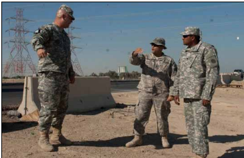
New York Army National Guard Soldiers assigned to Area Support Group Kuwait’s Base Defense Liaison Team discuss force-protection operations during a recent site visit. The team evaluates defenses, helps train security personnel and arranges for installations and movement of force-protection structures.