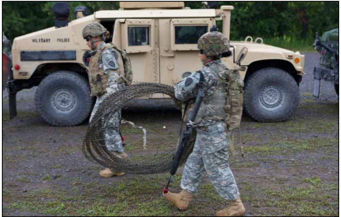
FORT DRUM, N.Y. -Female Soldiers of the 101st Expeditionary Signal Battalion conduct premobilization training Aug. 10th, 2012. The battalion, based in Yonkers, deployed to Afghanistan in Oct. 2012.

There are currently 1,657 women in the New York Army National Guard-- 159 Officers, 23