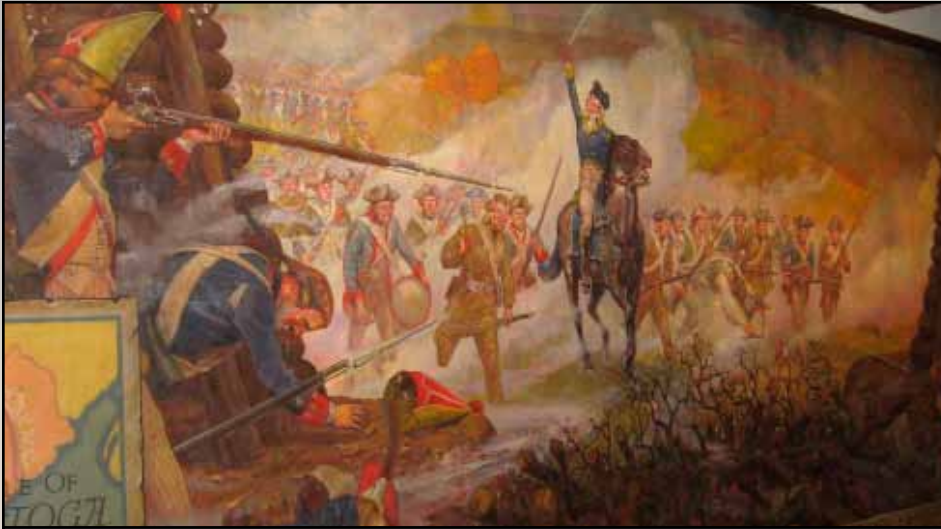
A detail from "Benedict Arnold, Triumphant at Saratoga". The painting, originally done for the Hendrick Hudson Hotel in Troy has been donated to the New York State Military Museum.,

Story and photos by Eric Durr, Division of Military and Naval Affairs