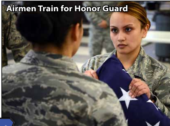
WESTHAMPTON BEACH - Airmen from the 106th Rescue Wing take part in Honor Guard training on December 13, 2012.