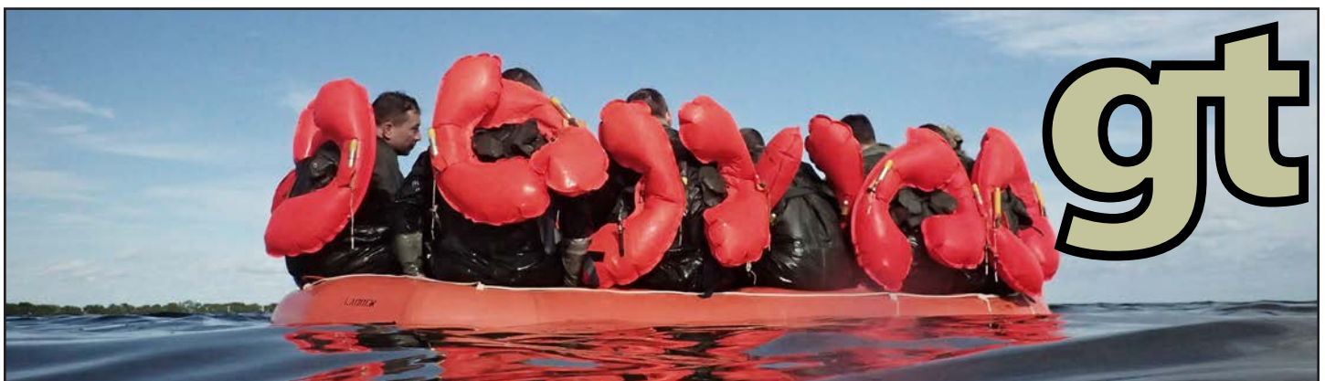
Members of the 101st Rescue Squadron conduct water-survival training near Homestead Air Reserve Base on Jan. 20. The squadron is part of the 106th Rescue Wing. More pictures can be found on page 26.