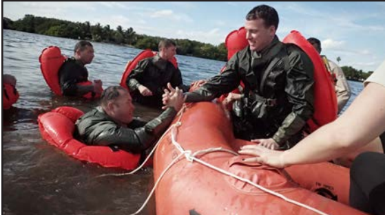
Members of the 101st Rescue Squadron conduct water-survival training near Homestead Air Reserve Base on Jan. 20. Members trained on the use of seven and twenty-man survival rafts, the ability to work as a team in open water, and the use of their survival equipment. The squadron is part of the 106th Rescue Wing. More pictures can be found on page 26.