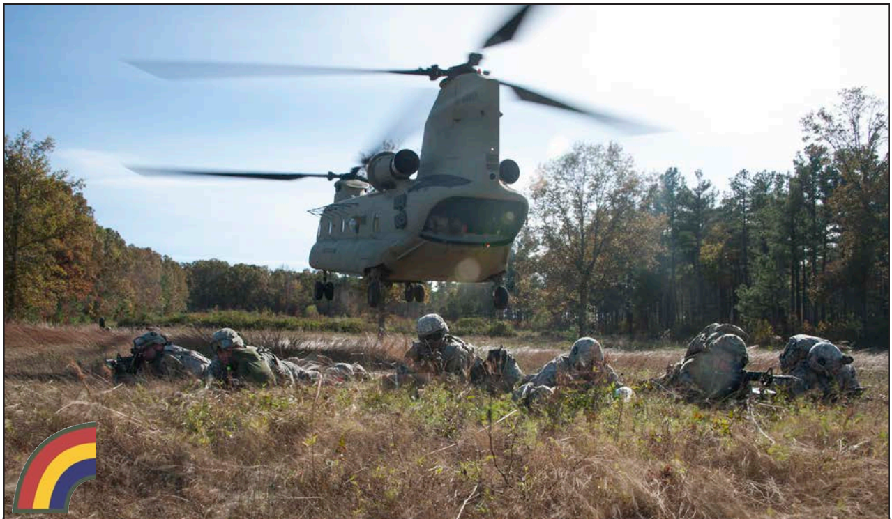
Soldiers of the 101st Division Artillery, 101st Airborne Division (Air Assault), establish security after being inserted into a landing zone by 42nd Combat Aviation Brigade aircrews.