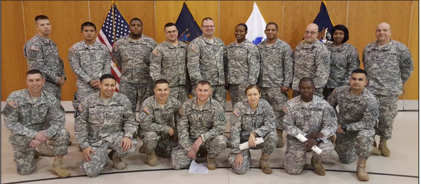
CAMP SMITH TRAINING SITE — Soldiers who successfully completed the 106th Regional Training Institute's Army Basic Instructor Course here pose for a class picture on Nov. 18. The class prepares officers and non-commissioned officers to provide effective classroom instruction. Participants included Soldiers from the New York Army National Guard's 106th Regional Training Institute, the 27th Infantry Brigade Combat Team, the 53rd Troop Command and a member of the District of Columbia Army National Guard.