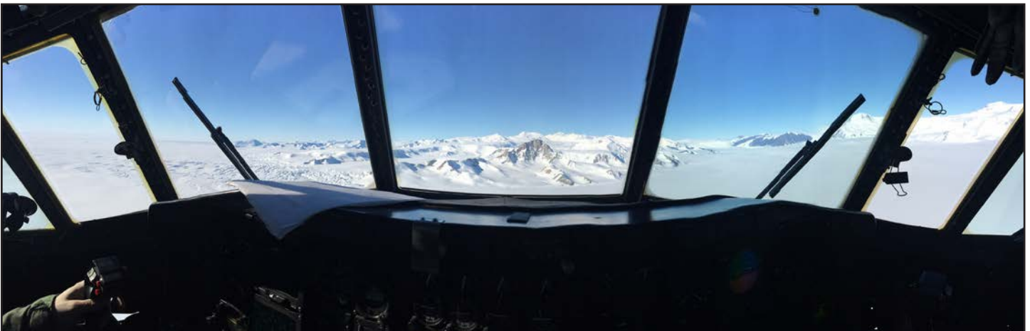
ANTARCTICA — An aircrew of the 139th Exeditionary Airlift Squadron fly an LC-130 "Skibird" in support of Operation Deep Freeze here on Dec. 2. A total of seven LC-130s were deployed from the New York Air National Guard's 109th Airlift Wing in Scotia, New York last season, which ended in February. This is the 28th season that the unit has participated in Operation Deep Freeze, the military component of the U.S. Antarctic Program, which is managed by the National Science Foundation.