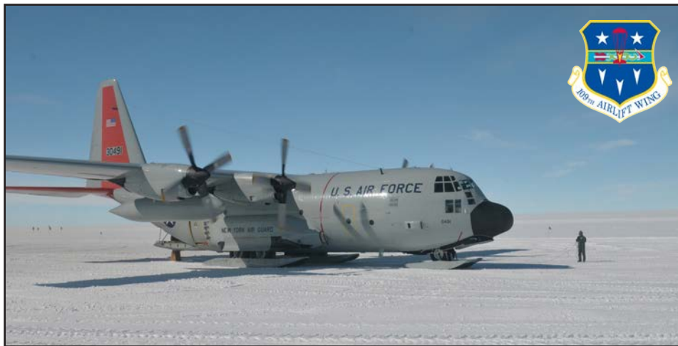
A New York Air National Guard 109th Airlift Wing LC-130 Skibird at Summit Station, Greenland, on June 30, 2015. Airmen and aircraft staged out of Kangerlussuaq, Greenland, during the summer months, supplying fuel and supplies and transporting passengers on the Ice Shelf in Greenland.