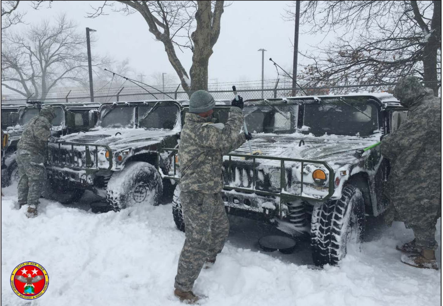
Soldiers of Joint Task Force Empire Shield clear snow from Humvees at Fort Hamilton, Brooklyn, on Jan. 23 as a major blizzard hits New York City.

The New York National Guard mustered 51 vehicles and had 329 Soldiers and Airmen on duty and ready to respond as a massive blizzard hit Long Island and New York City on Jan. 23.