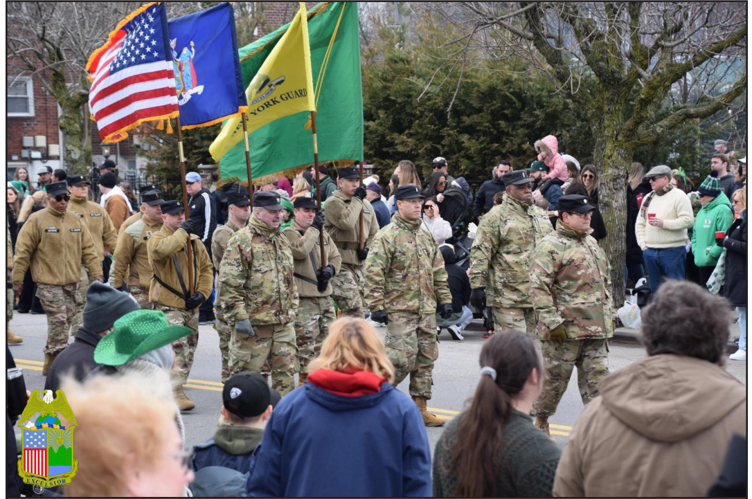
Members of the New York Guard's 88th Area Command march in the Queens County St. Patrick's Day Parade in Rockaway Beach on March 4, 2023.

"Given that our military lineage traces back to the Civil War Irish Brigade, it is appropriate that we