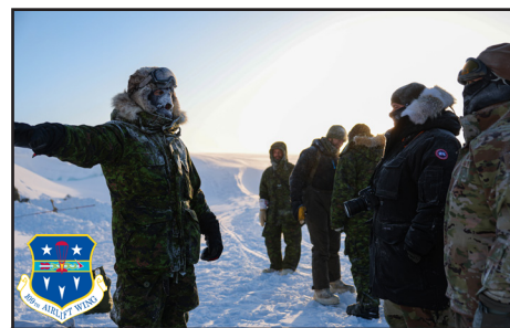
Airmen from the 139th Aeromedical Evacuation Squadron visit an arctic survival training camp in Resolute Bay, Nunavut, Canada, Feb. 23, 2023.

While the 139th has experience working in