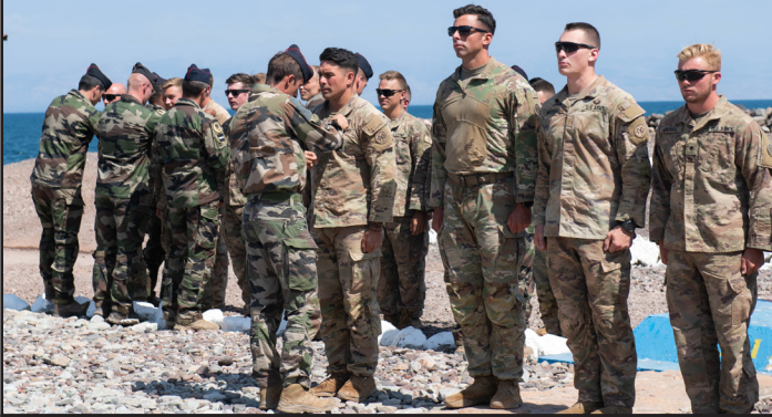
New York Army National Guard service members are presented with the French Desert Commando Badge during a ceremony following the completion of the French Desert Commando Course at the Centre Dentrainment Au Combat Djibouti, Feb. 2, 2023.