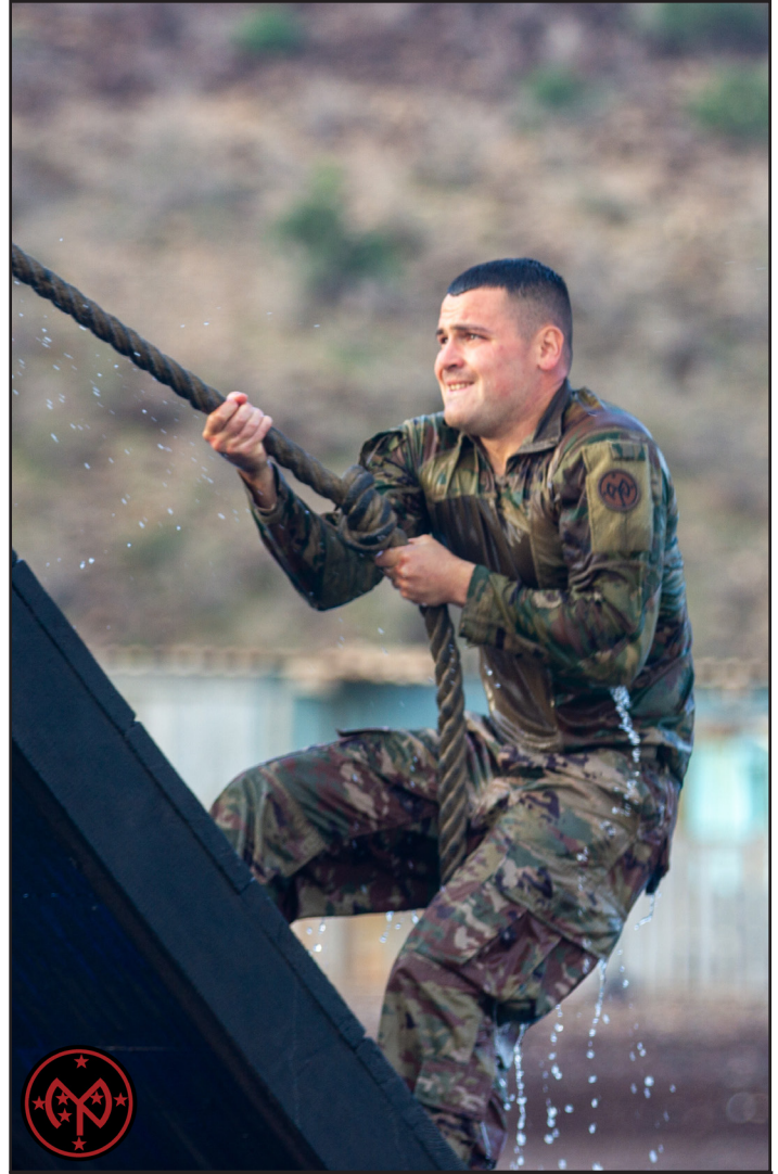
A Soldier assigned to the 1st Battalion, 69th Infantry Regiment, scales a water obstacle during the French Desert Commando Course at the Centre Dentrainment Au Combat Djibouti, Jan. 30, 2023.

they completed a ruck run and an intense water obstacle course before beginning the week-long commando training.