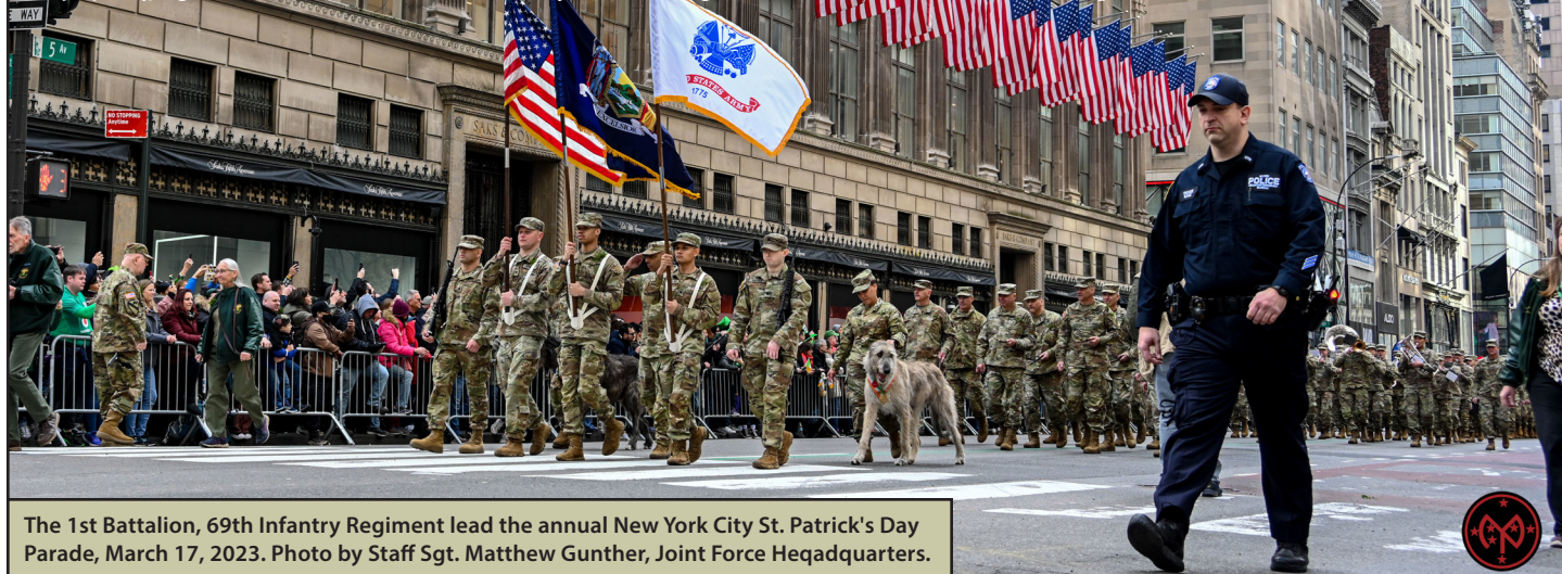
The 1st Battalion, 69th Infantry Regiment lead the annual New York City St. Patrick's Day Parade, March 17, 2023.