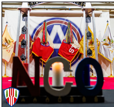
An arch made by Soldiers with the 783rd Support Maintenance Company, Task Force Red Ball, stands tall for non-commissioned officers to walk through during an NCO Induction ceremony held at Camp Buehring, Kuwait, Feb. 18, 2023.

But the regiment distinguished itself and became known as the Harlem Hellfighters for their determination in battle.