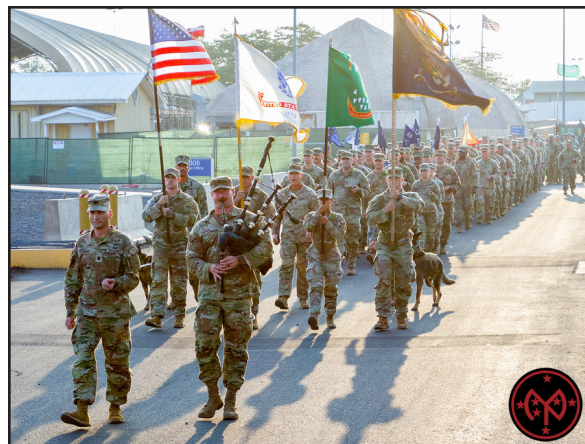
Soldiers of the 1st Battalion, 69th Infantry Regiment, on duty in the Horn of Africa, mark St. Patrick’s Day parading through Camp Lemonnier, Djibouti, March 17, 2023.

In both places, Soldiers placed springs of boxwood in their uniforms in commemoration of the 69th’s role in the Civil War during the December 1862 Battle of Fredericksburg. Soldiers of the Irish Brigade placed green boxwood sprigs on their blue uniforms to show that they were Irish before assaulting the Confederate positions.