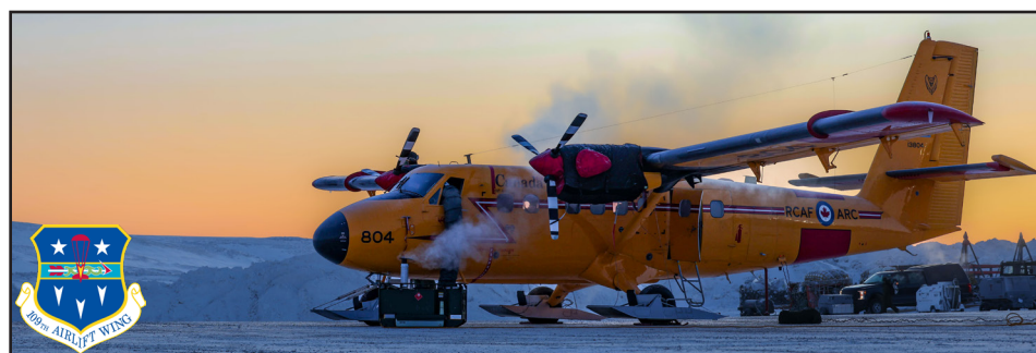
A De Havilland Canada CC-138 “Twin Otter” aircraft from the 440 Transport Squadron, Royal Canadian Armed Forces sits at the landing area at Resolute Bay, Nunavut, Canada 25 Feb. 2023.