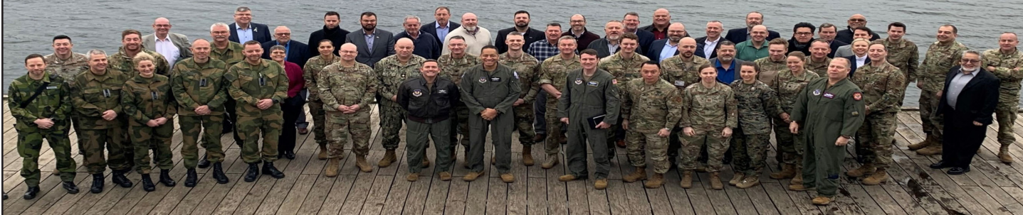
Military personnel from the United States, Denmark, Norway, Finland and Sweden pose for a photograph taken during a conference focused on sharing airspace information in Copenhagen, Denmark, January 2023.

COPENHAGEN, Denmark — Three New York Air National Guardsmen who specialize in planning and executing air war campaigns took part in a four-day workshop in January designed to ensure that the militaries of Denmark, Norway, Sweden and Finland all know what's flying in the skies above their region.