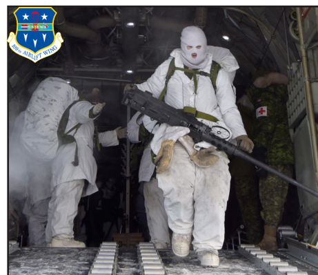
U.S. Army and Canadian soldiers offload an LC-130 Hercules flown by the 109th Airlift Wing during Guerrier Nordique in Nunavut, Canada, March 15, 2023. Both the 105th and 109th Airlift Wings provided critical lift to the participating units from five state.