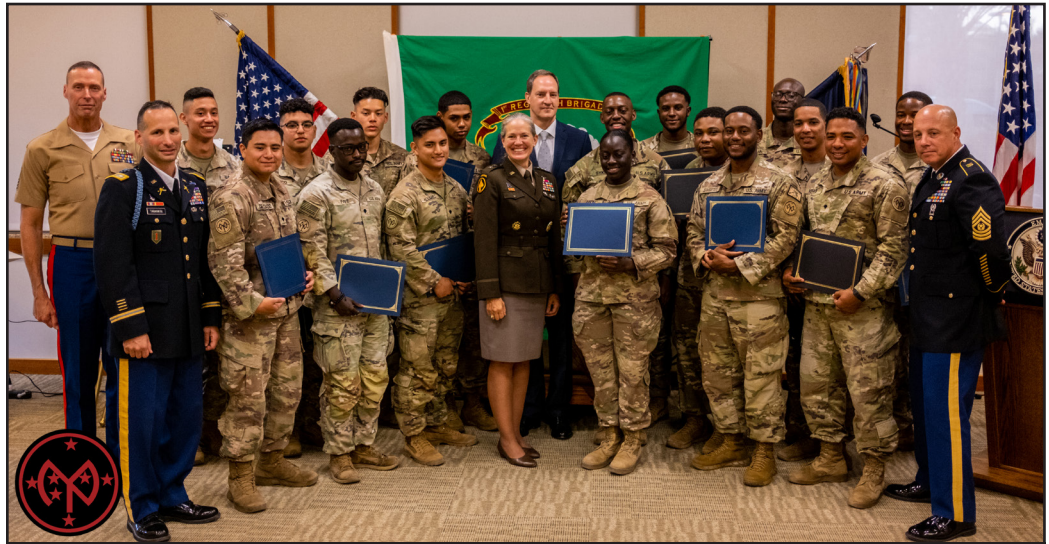
Fifteen New York Soldiers assigned to Combined Joint Task Force - Horn of Africa received their U.S. citizenship during a naturalization ceremony at the U.S. Embassy in Djibouti City, Djibouti, March 10, 2023.