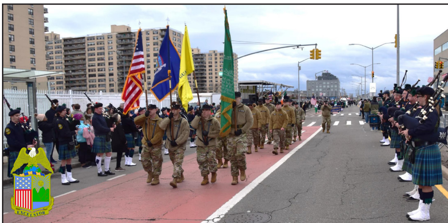
Members of the New York Guard's 88th Area Command march in the Queens County St. Patrick's Day Parade in Rockaway Beach on March 4, 2023.