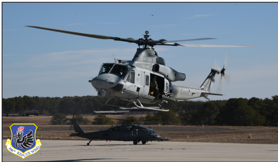
A Marine Corps UH-1Y Venom assigned to Marine Light Attack Helicopter Squadron 773 from Marine Aircraft Group 49, takes off during a training exercise alongside an HH-60G Pave Hawk assigned to the 101st Rescue Squadron at Francis S. Gabreski Air National Guard Base in Westhampton Beach, New York, Feb. 2, 2023.

“The FARP exercise allows us to practice something that’s kind of non-standard for us. Just another option to have overseas for flexibility, getting fuel from another rotary-wing aircraft, potentially at a remote site where otherwise, it may not be possible to accomplish