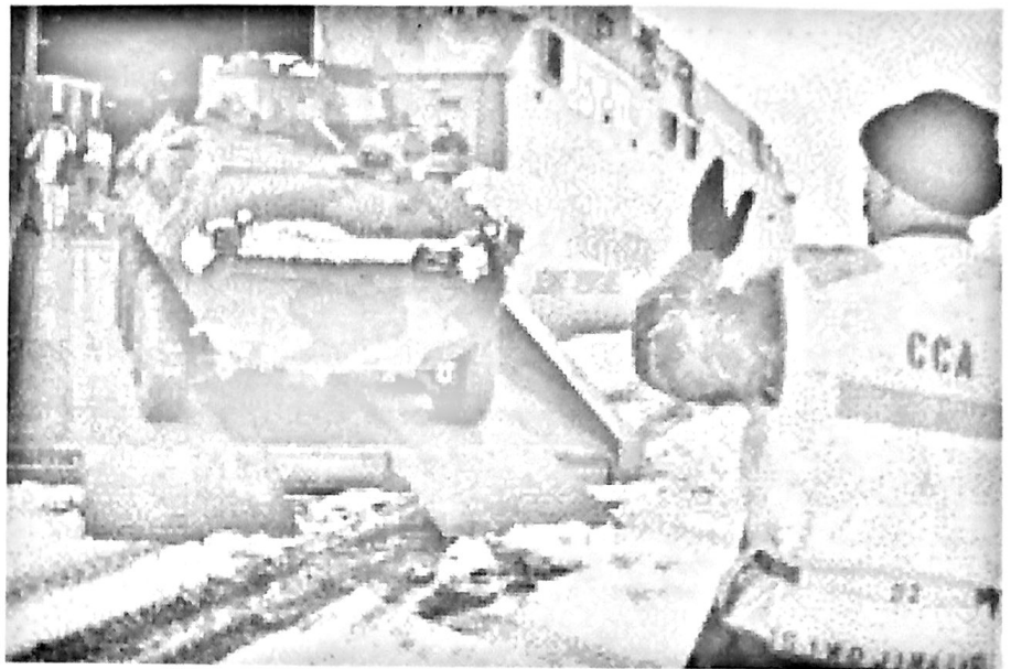
A Marine LAV is guided off the Joint High Speed Vessel during a port seizure operation in Kryusaeterora, Norway March 11. The JHSV was being used in support of Marine Corps Air-Ground Task operations for the first time during Battle Griffin-02 in Norway March 7-14.

Prior to departing for Norway, most of the Marines underwent cold weather training that included topics such as use of warming tents, camp stoves, snowshoes and sleeping systems. Upon arrival, they immediately learned how to drive on snow and ice, how to heat MRE's and stay hydrated. The Marines attest that there is no substitute for the real thing.